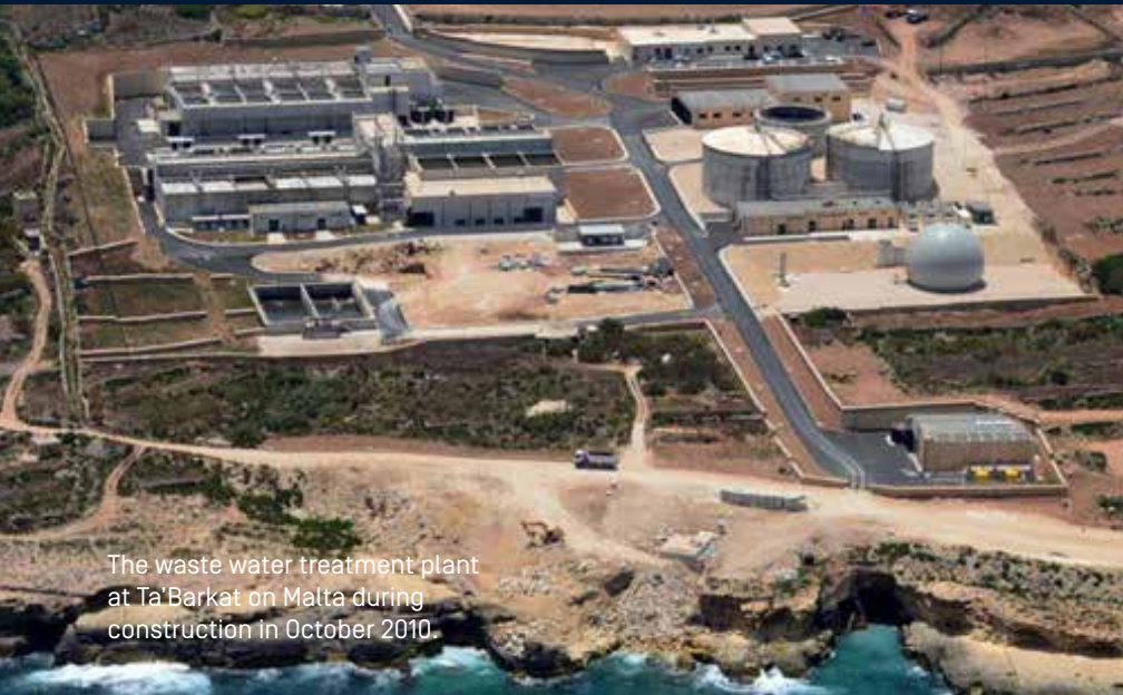
The waste water treatment plant at Ta'Barkat on Malta during construction in October 2010.